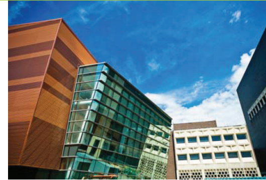
EE's home, Barbara and Jack Davis Hall

Material from the first three years forms a solid foundation for exploring advanced systems and specific applications via technical electives courses. In addition, Senior Design Implementation, a capstone course taken in the final semester of study, allows students to work as part of a team in developing projects, learning how to take a design from a concept on paper to a finished product. These hands-on laboratory and project experiences allow our seniors to gain real-world experience and to prepare for the job market or graduate study.