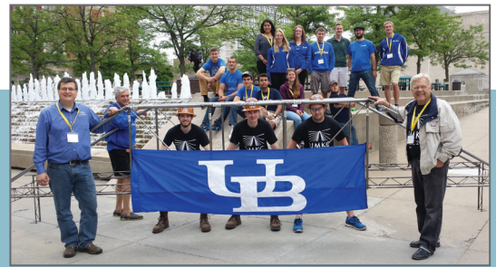
UB-ASCE's Student Chapter Steel Bridge Team won 4 th place overall in the 2015 National Student Steel Bridge Competition.

To apply, please visit admissions.buffalo.edu .